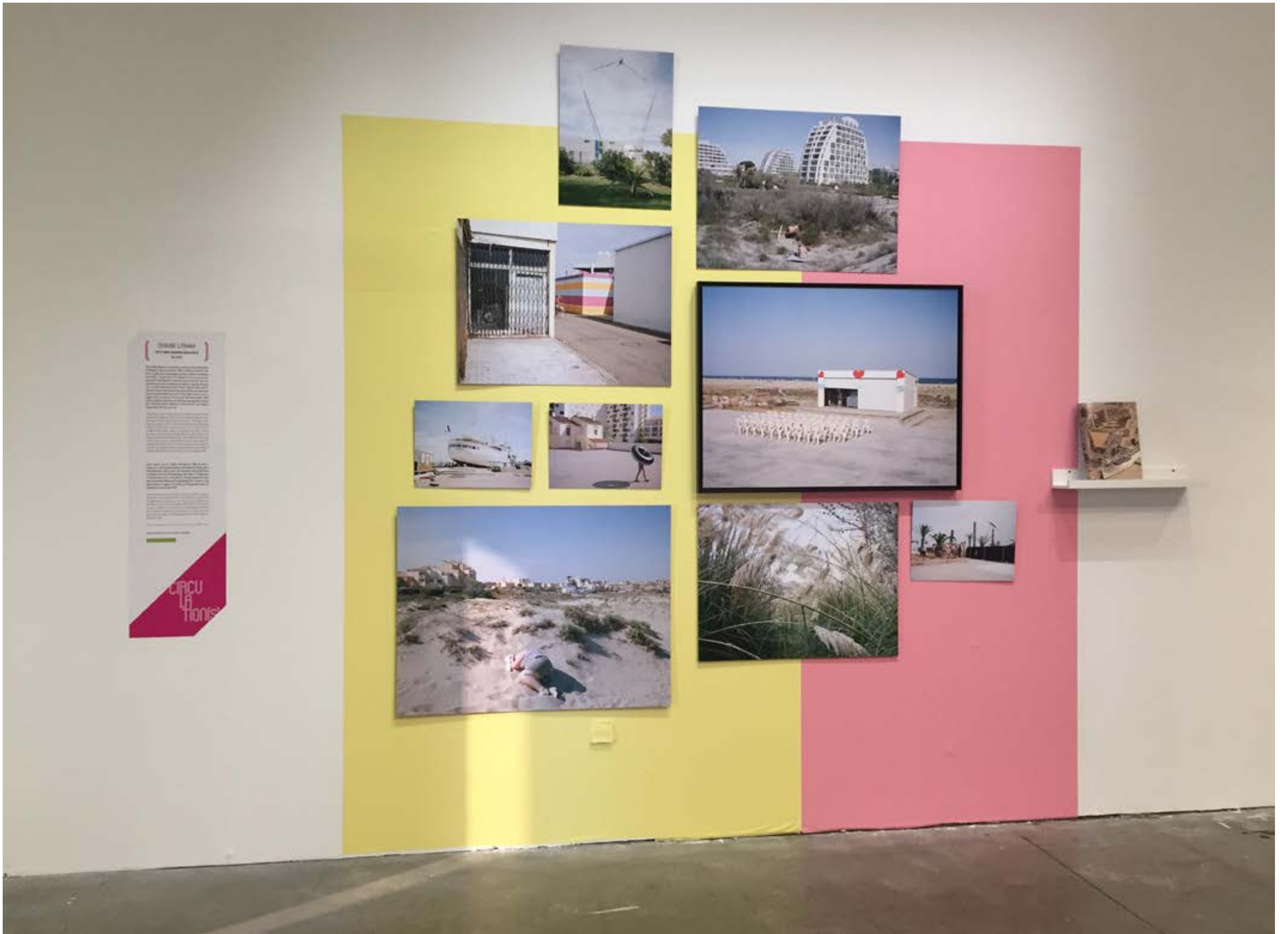
Circulations Festival, Paris, April 2016