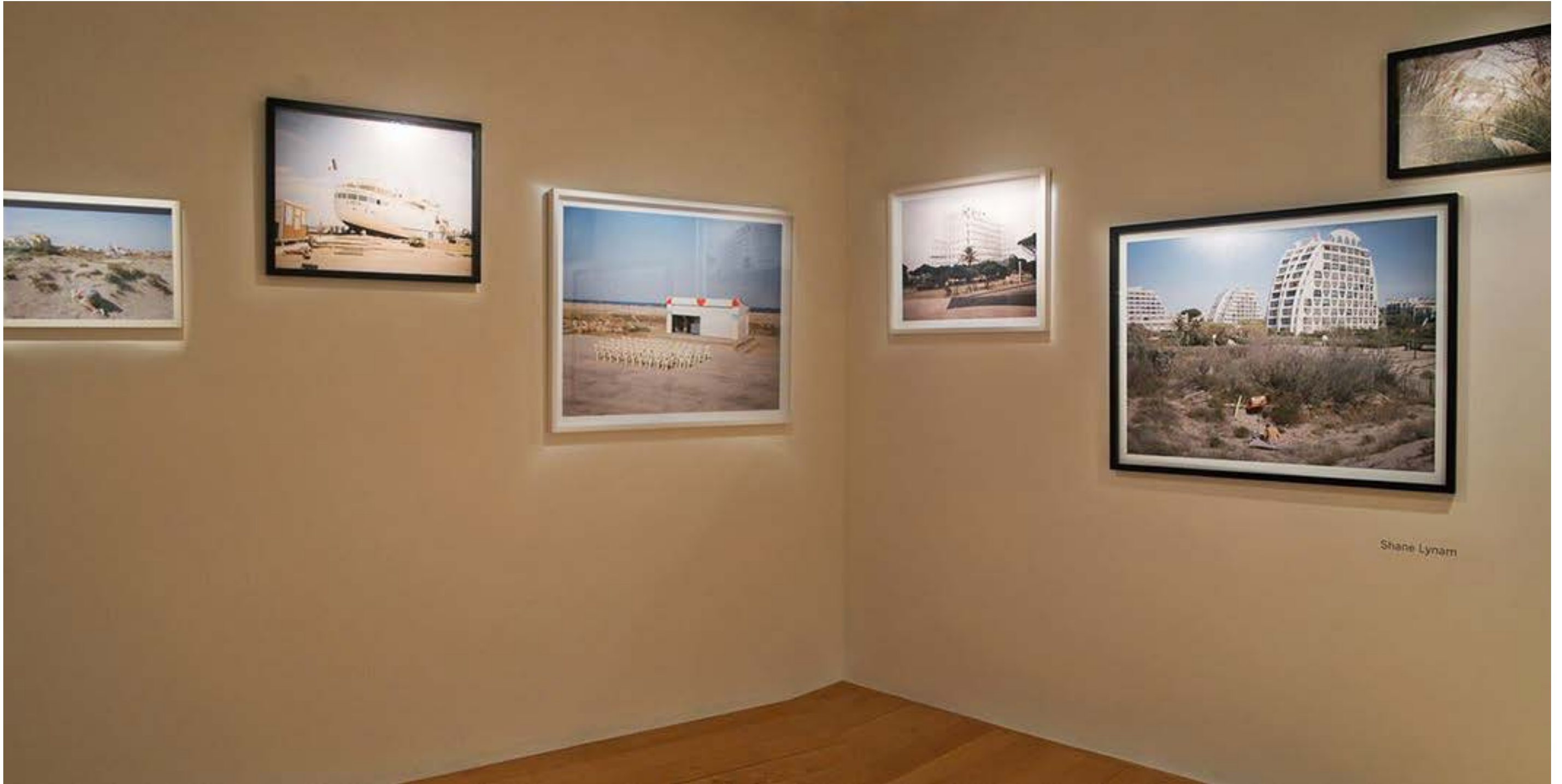
Solas Award Show at the Gallery of Photography, Dublin, December, 2015